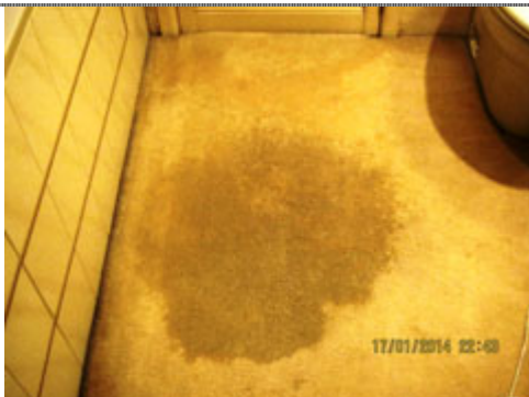
My bathroom floor on 17 Jan 14, at 22h43.

On 17 Jan 14, at c. 22h30, after unlocking the doubly-locked door to my apartment, as soon as I came in, I could smell that the carpet was soaked.