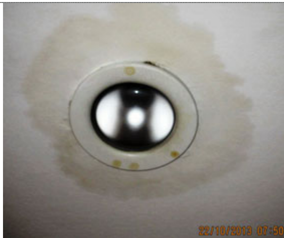
Photo of bathroom ceiling taken the following morning i.e. on 22 Oct 13

(2) On that day, on my return to my apartment, at c.22h00, I saw a wet patch on the carpet in the bathroom, and water dripping from one of the spotlights: