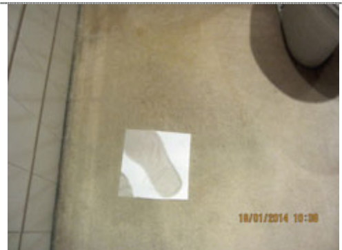
My bathroom floor on 18 Jan 14, at 10h38

The wet area is IMMEDIATELY below the spotlight from which the water had been dripping on 21 Oct 13 (above). HOWEVER – this time: