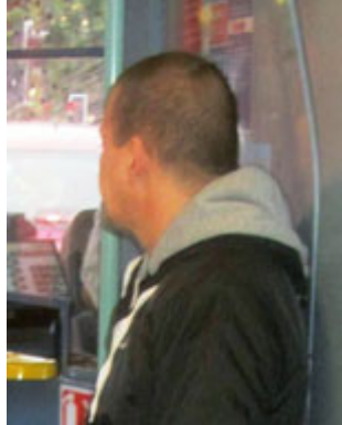
21 Oct 13 – 08h21