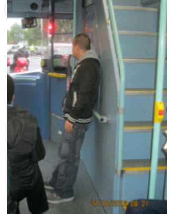
21 Oct 13 – 08h21

(2) On that day, on my return to my apartment, at c.22h00, I saw a wet patch on the carpet in the bathroom, and water dripping from one of the spotlights: