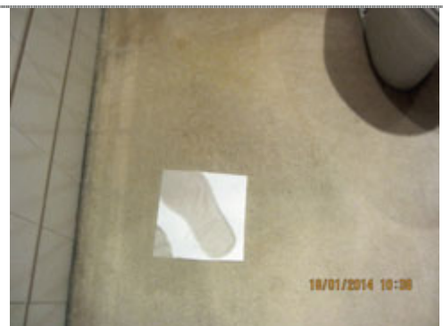
My bathroom floor on 18 Jan 14, at 10h38

The wet area is IMMEDIATELY below the spotlight from which the water had been dripping on 21 Oct 13 (above). HOWEVER – this time: