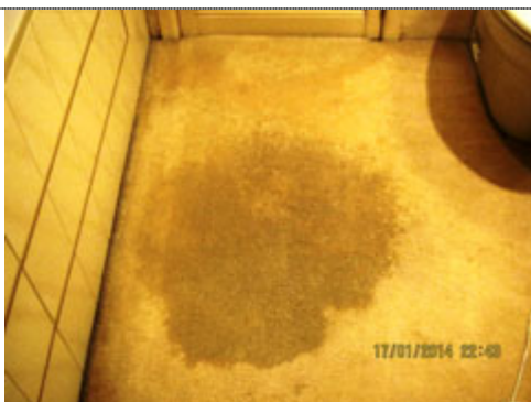
My bathroom floor on 17 Jan 14, at 22h43.

On 17 Jan 14, at c. 22h30, after unlocking the doubly-locked door to my apartment, as soon as I came in, I could smell that the carpet was soaked.