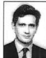
Matthew Cunliffe Property Management