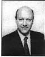
Clive Kemp Investment