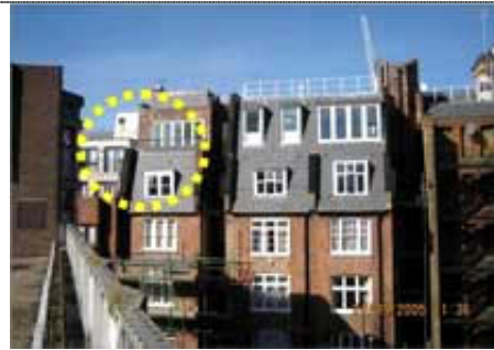
Back of Jefferson House – September 2005