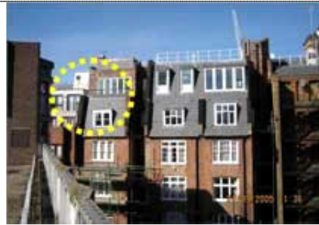
Back of Jefferson House – September 2005