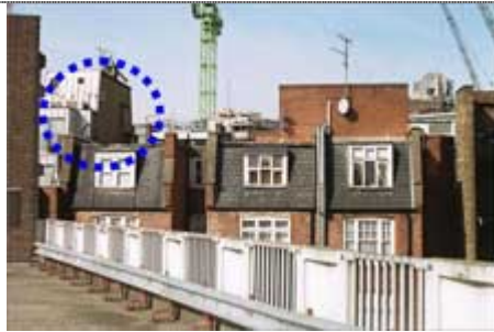
Back of Jefferson House – July 2002